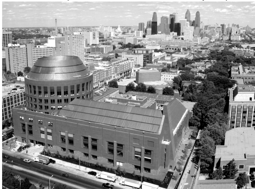
Aerial view of Jon M. Huntsman Hall and the Philadelphia skyline

What follows is a detailed description of the curriculum for the Bachelor of Science in Economics degree. We recommend that you follow along with the worksheet as you read about the various requirements, so that you begin to understand how everything fits together.