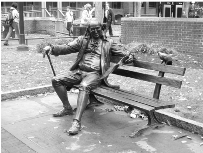
Statue of Benjamin Franklin